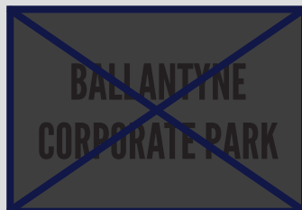
NO DARK TEXT ON DARK BACKGROUNDS