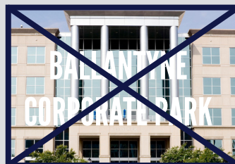
NO TEXT OVER BUSY IMAGES