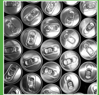
ALUMINUM AND METAL

*Keep all recycleables clean, dry and free from food/drink waste.